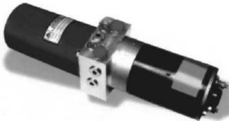
MINIAGGREGAT MINI AGREGAT MINI POWER UNIT