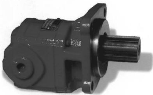
ZAHNRADPUMPE ZOBNIŠKA ČRPALKA GEAR PUMP