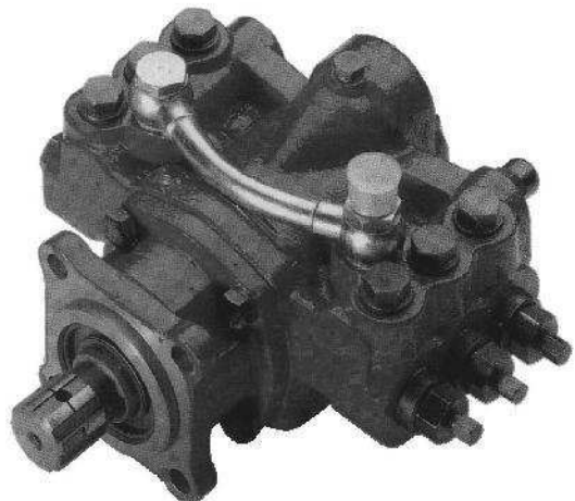
RADIALKOLBEN PUMPE RADIALNA BATNA ČRPALKA RADIAL PISTON PUMP