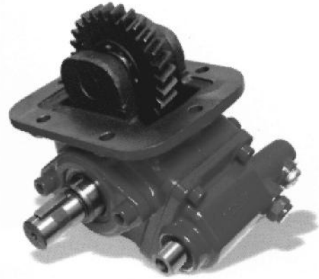
ABTRIEB ZF ODGON ZF CATTLE DRIVE ZF