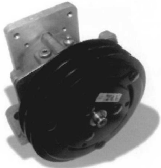
ELEKTROMAGNETISCHE KUPPLUNG ELEKTROMAGNETNA SKLOPKA ELECTROMAGNETIC CLUTCH