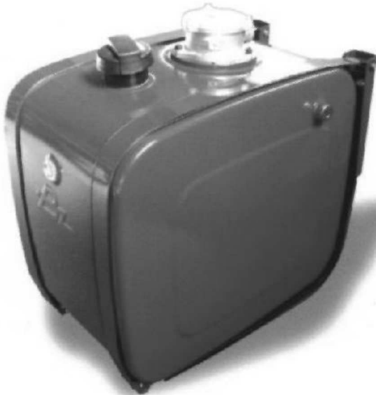
ÖL TANK OLJNI REZERVOAR OIL TANK