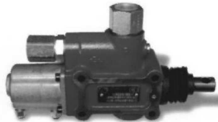
AUFSTEIGENDE VENTIL DVIŽNI VENTILI LIFTING VALVE