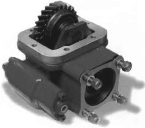
ABTRIEB IVECO ODGON IVECO CATTLE DRIVE IVECO