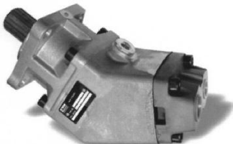
AXIALKOLBEN WINKELGRADPUMPE AKSIALNA BATNA KOTNA ČRPALKA AXIAL PISTON PUMP